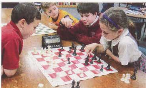
Boy & Girl Scouts